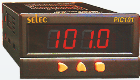
48 x 96mm