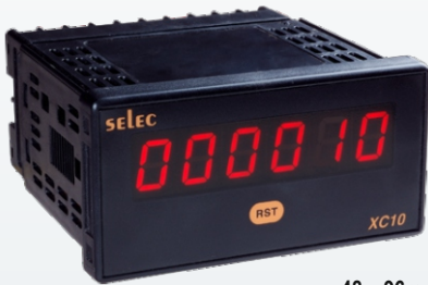
48 x 96mm