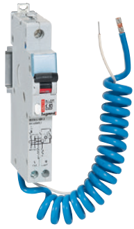
6 064 15

residual current circuit breakers from 10 A to 45 A - AC type